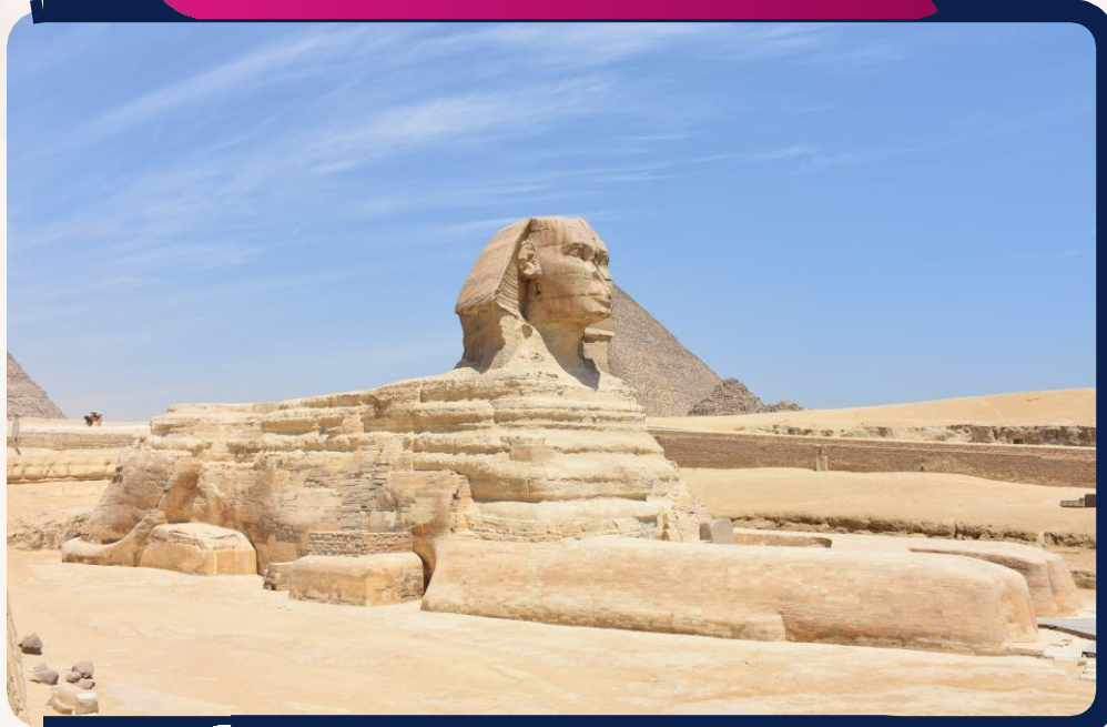
The Great Sphinx